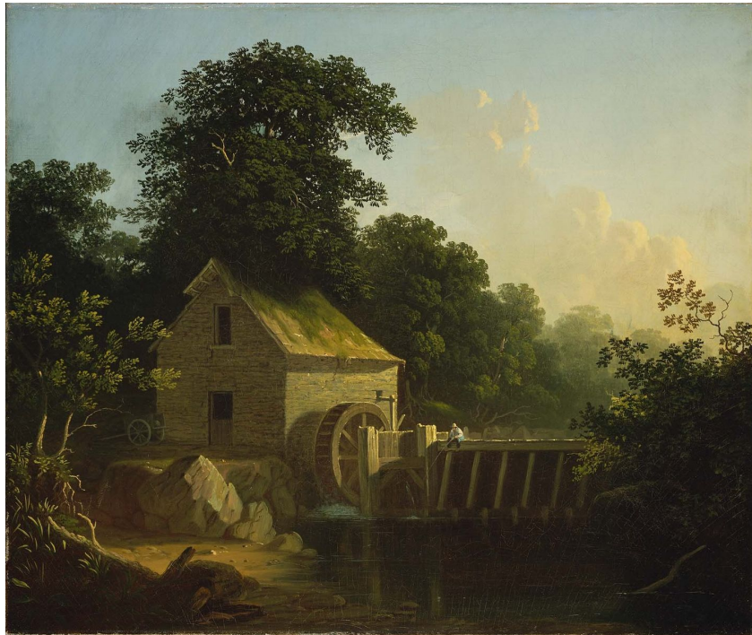
Landscape with Waterwheel and Boy Fishing, by George Caleb Bingham (Museum of Fine Arts Boston)